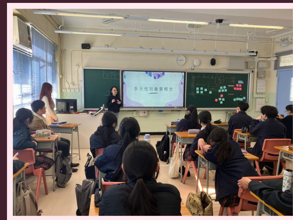
Practice in real world